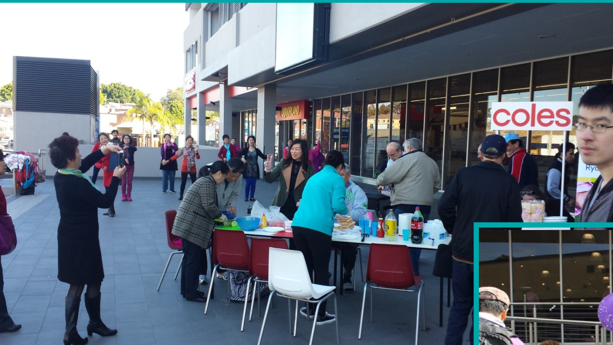
Chinese Community Dance Group