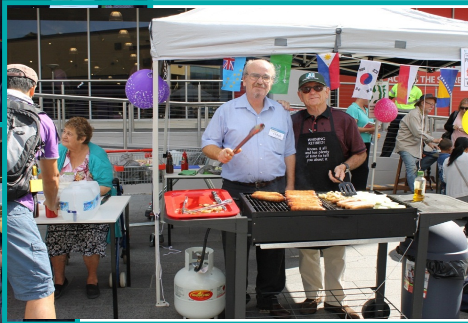
Men's Group Musicians